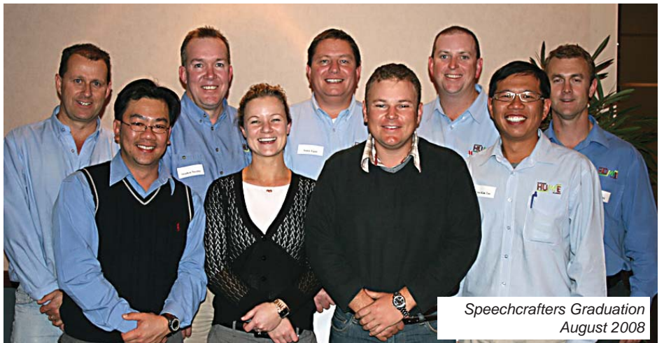
Speechcrafters Graduation August 2008